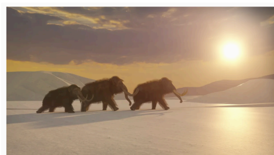
Three woolly mammoths (Mammuthus primigenius) stride across a snow-covered landscape.